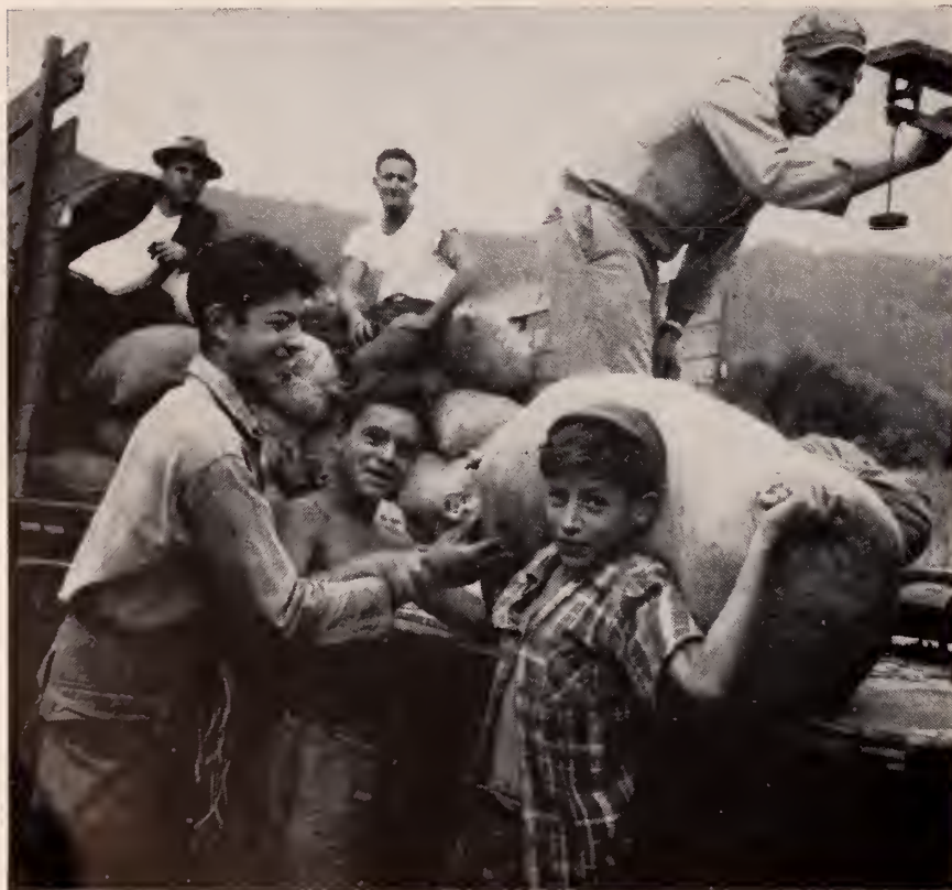
THE HOME MISSIONS COUNCIL carries on a vigorous program among migrant workers in all parts of the country. Home for these lads is where the crops are ready for harvest

For an illiterate adult Navajo who speaks no English, learning